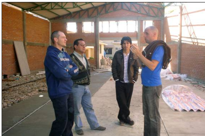
Walls, roof and floor all nearly finished!

own meeting facility – even though they didn't have enough money. And they were committed to not borrowing the funds.