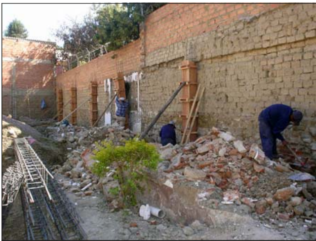
Construction is underway — July 7th!