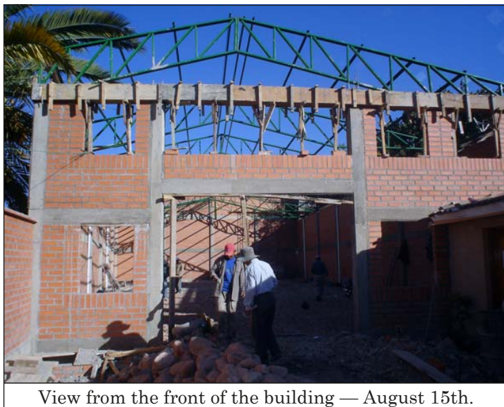
View from the front of the building — August 15th.

For years the Cochabamba International Church has been renting meeting space. Most recently the CIC has been renting from a local University. One Sunday there was a robbery and the school felt that it might have been related to the church meeting in the facilities. This prompted them to raise the rent significantly. The leadership team felt that this was a sign that it was time to step out in faith and begin building their