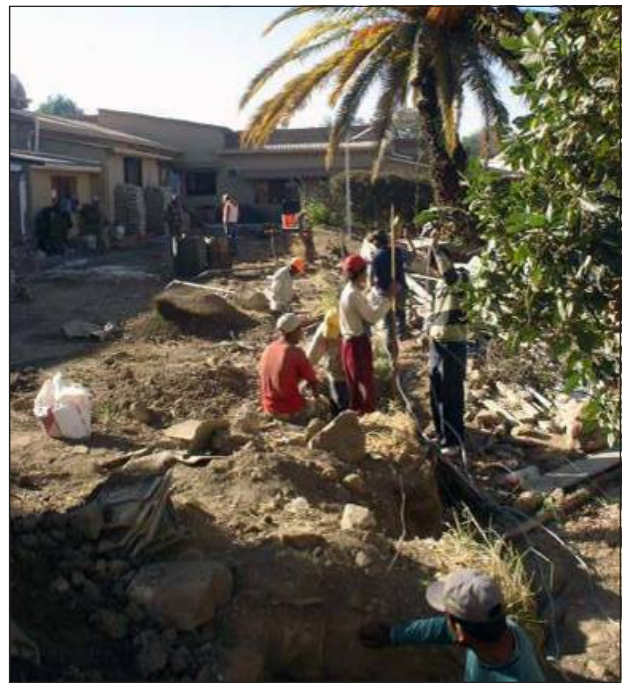
Clearing the land and getting ready to start.