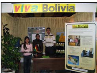
Our team at a recent conference

We are so thankful for the opportunity to have served in Bolivia and praise God for allowing us to be a part of the work He is accomplishing in Bolivia.