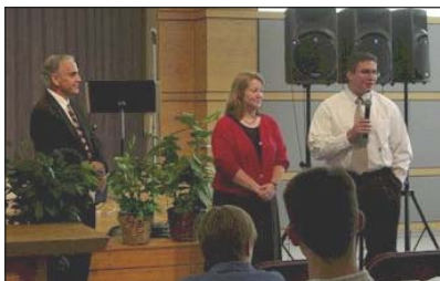
Speaking at First Free Methodist Church

On October 2, we returned to Bolivia after 2 1/2 months in the United States. During our time in the U.S., we spoke at eight churches, a Rotary Club and the Uni-