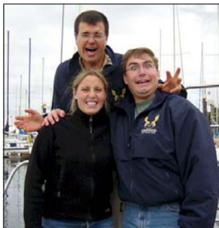
Another successful boat docking!